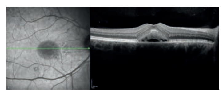
Central Serous Chorioretinopathy (CSCR)