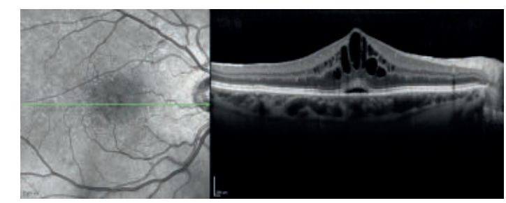
Diabetic Macular Edema